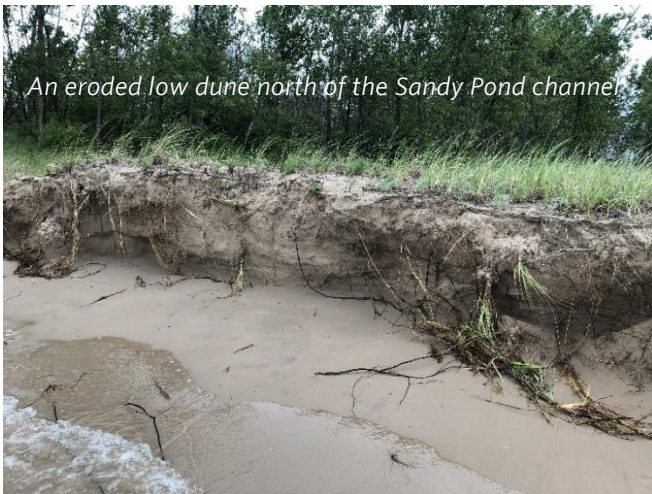
An eroded low dune north of the Sandy Pond channel.

The beaches and dunes of the magnificent eastern Lake Ontario shoreline are constantly changing, thanks to winds from the west that drive storms and waves across the 180-mile length of Lake Ontario. North and South Sandy Ponds form the geographic center of this shoreline, with a common connection to Lake Ontario through a narrow channel in North Pond. Eastern Lake Ontario's beaches, including the three-mile barrier that shelters